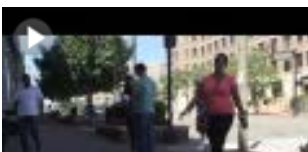
Hypocrite Libs: 'Bring Illegal Immigrants' - Just Not to