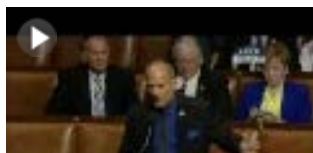
Nancy Pelosi Chases Republican Across House